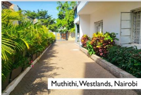
Muthithi, Westlands, Nairobi