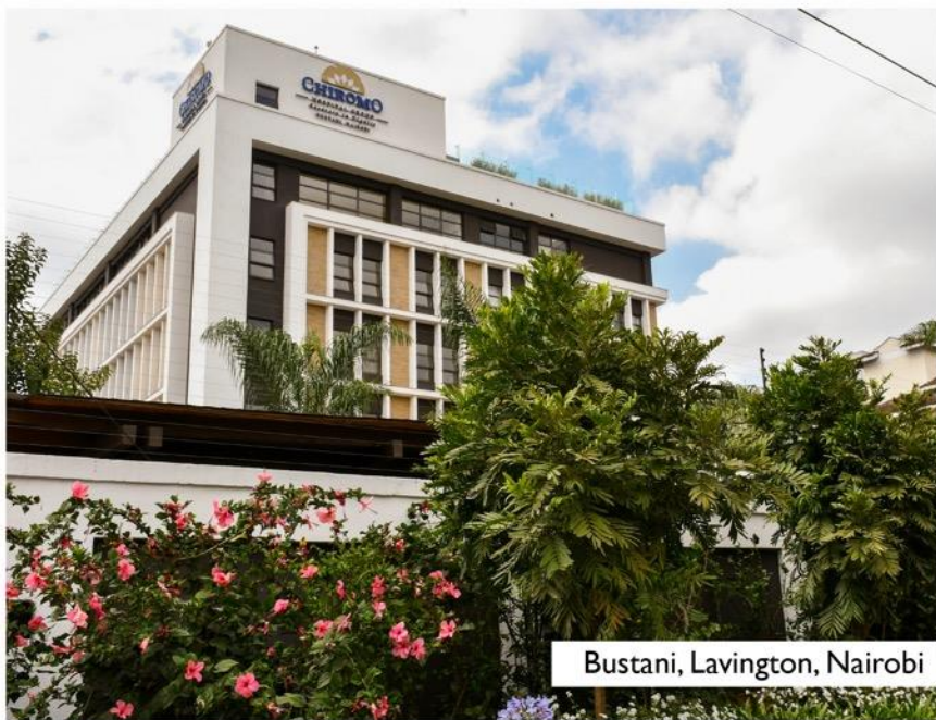
Bustani, Lavington, Nairobi