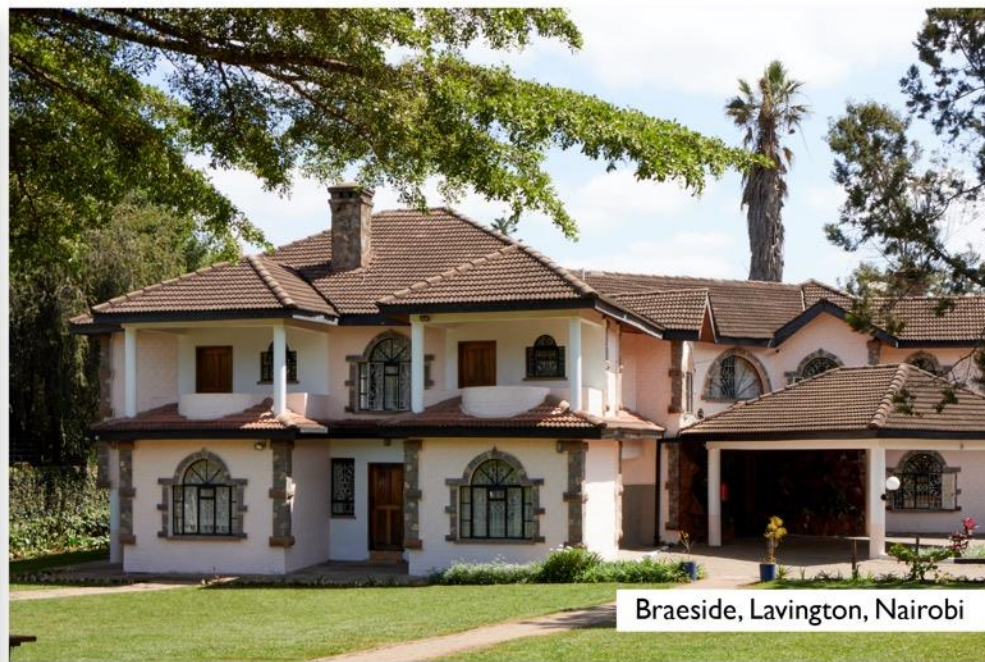
Braeside, Lavington, Nairobi